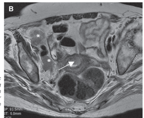
B: Pelvic magnetic resonance imaging revealed an endometrial tumour (arrow) and multiple enlarged lymph nodes (asterisks).